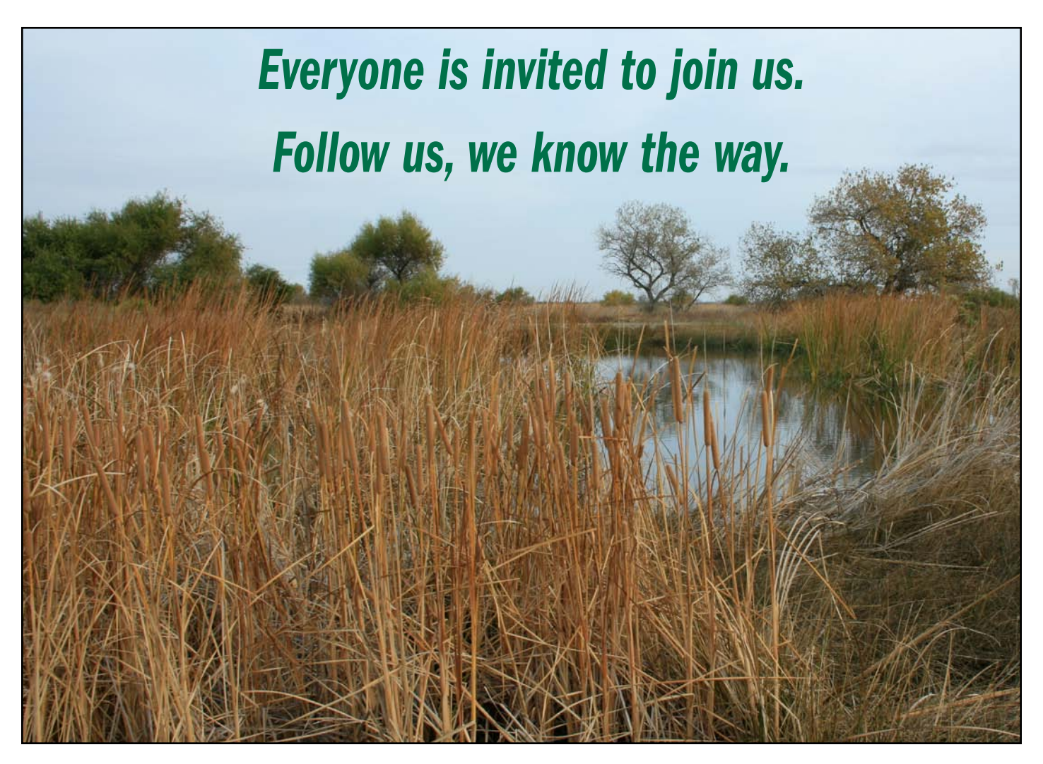
California has lost most of its coastal and interior wetlands to development. Shown here is the C.E. Van Atta Interpretive Marsh and Walking Trail at the Los Banos WIldlife area. November 2009 photo by Tom Politeo.

The Angeles Chapter leads these outdoor activities as a public service to everyone interested in coming along. We offer diverse physical activities — walks, hikes, kayaking, bicycling, backpacking, outdoor photography and more—all covered in these pages.